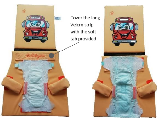
For diapers up to No. 4